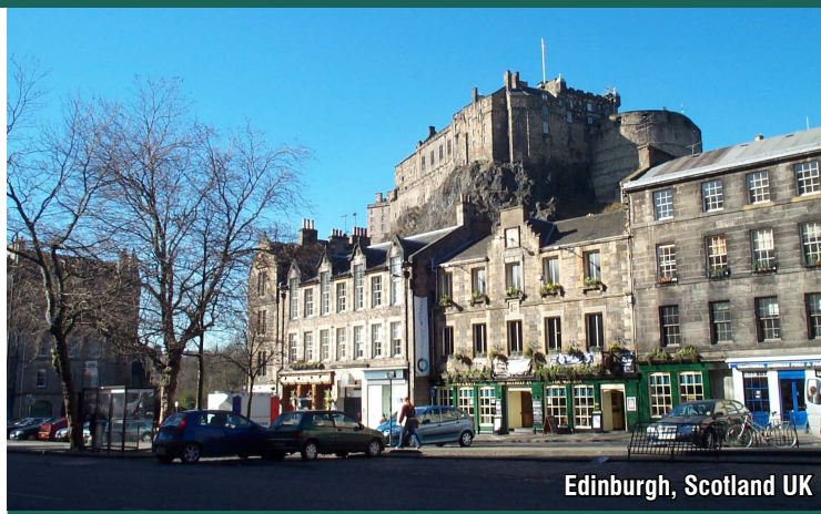
Edinburgh, Scotland UK